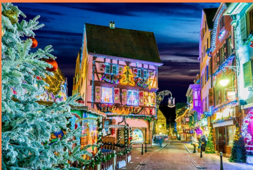
The Colmar Christmas Market in France lit up with decorations.

Many people stay up late to see the old year out and the New Year in. Different countries in the world ring church bells, toot horns, blow whistles and shriek sirens. In most European countries, the festive season begins with the Christmas theme and famous Christmas markets.