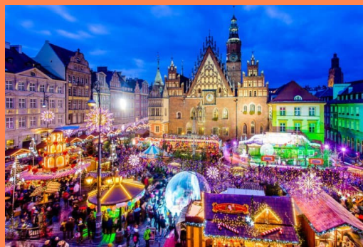
Christmas market in Wraclaw, Poland.

In Australia, New Year's Eve is in the middle of summer where we can enjoy outdoor events. The Sydney Harbour Bridge displays a splendid firework show and big city squares swarm with people and live concerts.