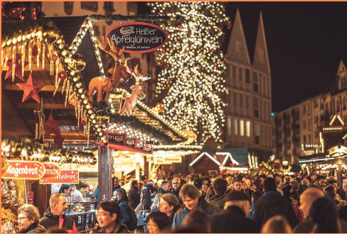
Christmas market in Berlin.

Many cultures celebrate the New Year on different days, and we will reflect on them as they come. Let us look at how the world celebrates this time of year.